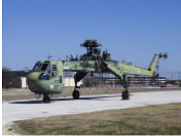
CH-54A Sikorsky Sky Crane

The landing in the nearby chapel parking lot drew large crowds of onlookers, as well as press and media coverage. The CH-54A served in Vietnam with the 487 th Heavy Lift Company that was attached to the 1st Cavalry Division. The workhorse was used throughout the 1960s to transport up to 20,000 pounds of equipment and men. The helicopter was one of the largest in the Army's inventory, standing eighteen feet tall and seventy-two feet long. The forward three-crew cockpit is joined to the tail rotor section by a narrow structural beam, which supports the main rotor. A large vacant space between houses the winch, which could carry a slung or containerized load.