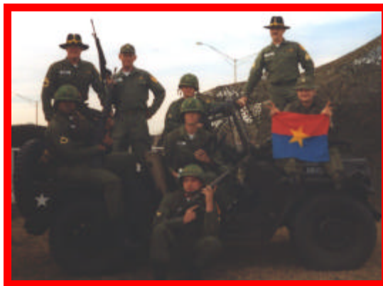
1st Cavalry Division soldiers and museum staff