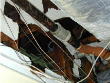
The pipe that failed. Note the standard black iron piping (now rusted). New galvanized compression collars have been installed over new rubber gaskets in this area.

It is critical that every U.S. Army museum take action to have its local fire authorities inspect its fire suppression systems, if installed. If rubber gaskets are found, they should be replaced. All elements of the systems should be inspected, including those in ceilings and other hidden spaces. Cutoffs and other valves should be tested for leaks, and it may be prudent to drain and refill the systems, checking for rusty water.