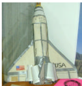
Styrofoam coffee cup model

Photographs and artifacts in the in-house exhibit tell how hundreds of reporters and thousands of visitors descended on the missile range to view the landing. One artifact is a model of the shuttle cleverly jury-rigged by a bored reporter from Styrofoam coffee cups and duct tape. The exhibit will be up through the end of 2002.