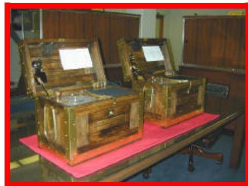
Reproduction Beardslee electromagnetic telegraphs U.S. Army Signal Corps Museum