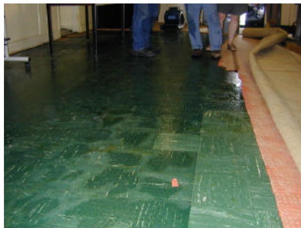
Floor area with soaked carpet being removed

approval of the Director of Training (DOT) to contract for a commercial carpet cleaning and water extraction service. Thanks to the timely decision on the part of the museum staff and the DOT, substantial water damage was avoided. This prompt action seems to have averted any potential mold growth in the affected areas. The worst damage was to the director's office where some files, reference books, and personal effects got wet.