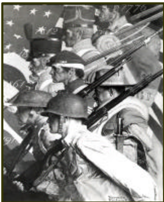
To Make Men Free Norman Rockwell, oil, 1948. In the collection of the National Museum of the United States Army

Happy 227th Birthday to the men and women of the United States Army 14 June 2002